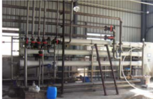
Pilot Unit Used During The Study